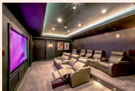
'OLYMPIC GAMES 2024