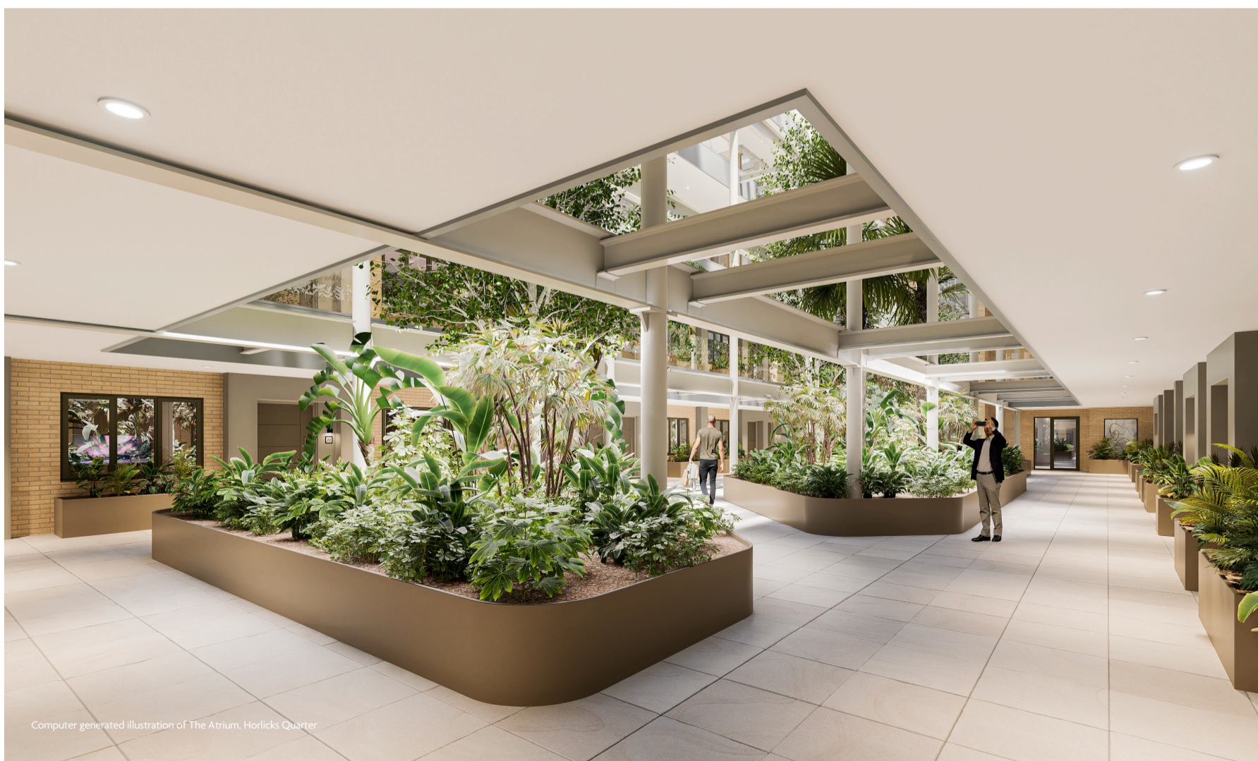
Computer generated illustration of The Atrium, Horlicks Quarter