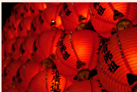
CHINESE NEW YEAR