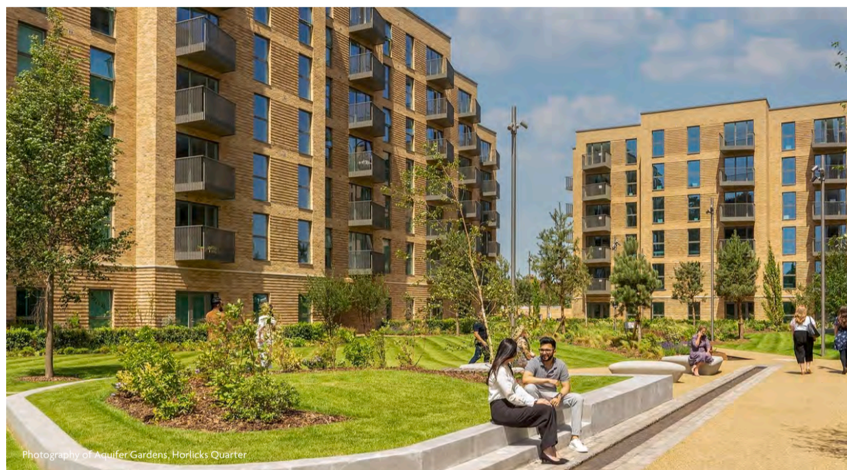
Photography of Aquifer Gardens, Horlicks Quarter

We look forward to seeing Clocktower Place coming to life, as we start to open up more areas of the development for everyone to enjoy.