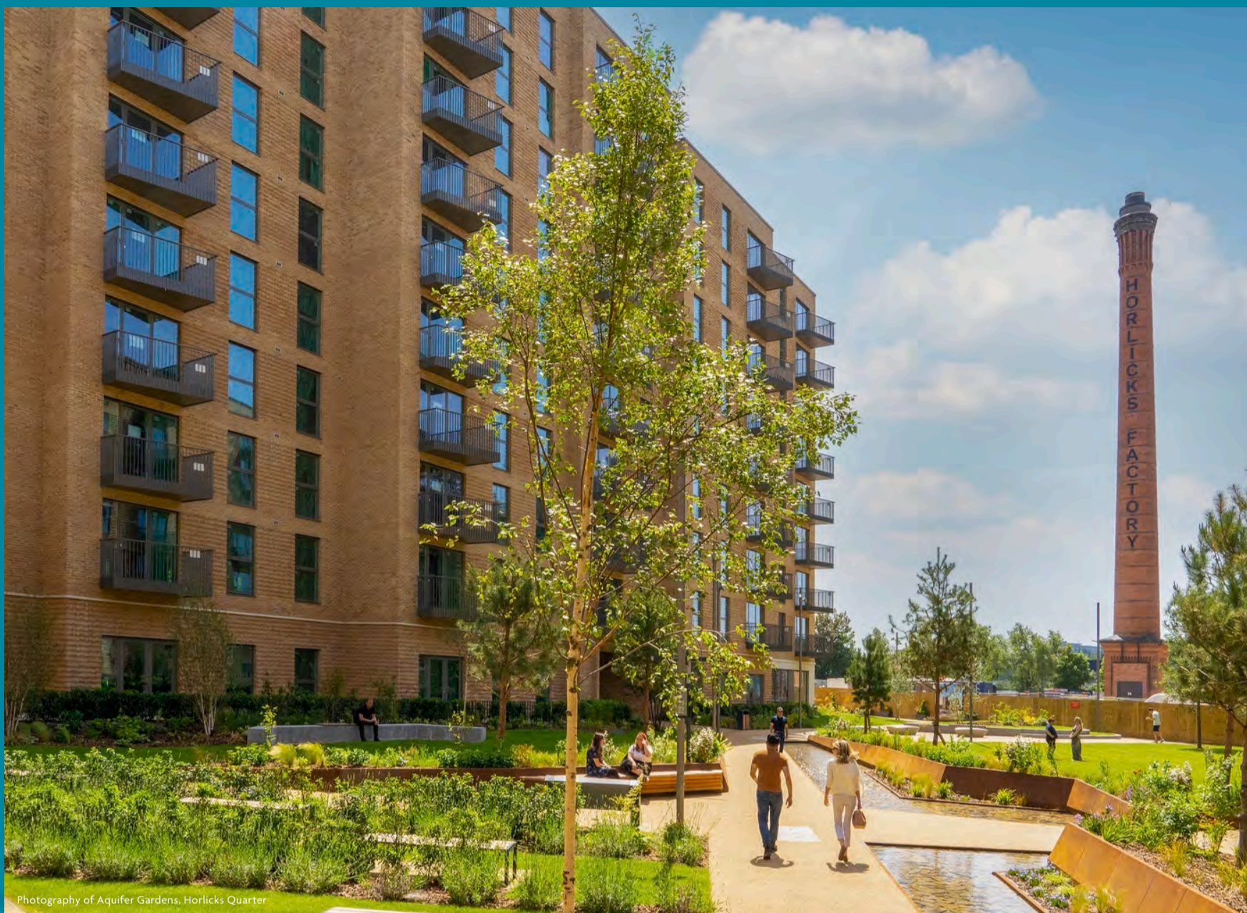
Photography of Aquifer Gardens, Horlicks Quarter