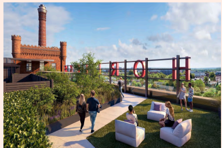
SUNSET ROOFTOP EVENT